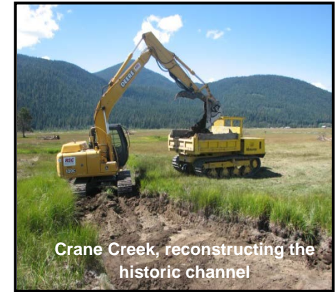
Crane Creek, reconstructing the historic channel