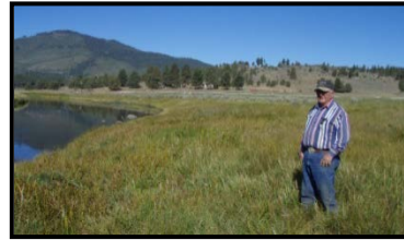
Sprague River rancher surveys his riparian recovery

Examples of fish and wildlife habitat projects may include spring reconnection, lake shoreline protection, fish barrier removal, restoration of stream channel morphology, and removal of conifers encroaching into Oregon oak woodlands.