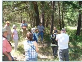
An organized group learning about oak woodland ecology